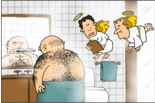
(See Matthew 10:29-31) 11-16-2005 WE ONLY HAVE TO NUMBER THE HEAD HAIRS, RIGHT?