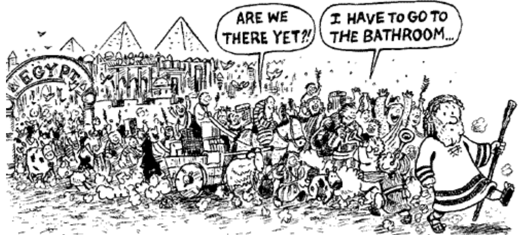
MOSES' FIRST SIGN OF TROUBLE.