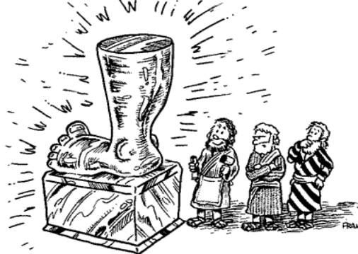
UM, WHEN WE ASKED YOU TO MAKE US A GIANT GOLDEN CALF,... UH...